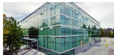
Seminaris CampusHotel Berlin Takustraße 39, 14195 Berlin